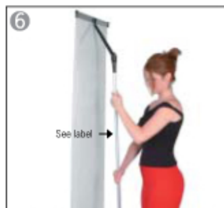
6 Raise top section of pole to apply tension, twist anti-clockwise to lock in place (clockwise to unlock).