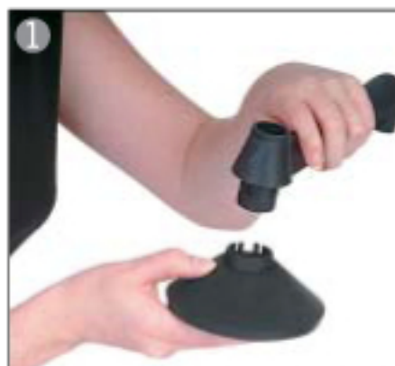
1 Attach bottom rail support to base, opposite the Mark Bric logo