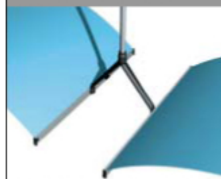
Double sided display uses 2 rail supports on bottom instead of base, as well as 2 rail supports on top.