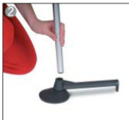
2 Attach pole to base