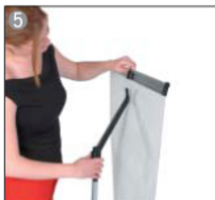
5 Attach top rail