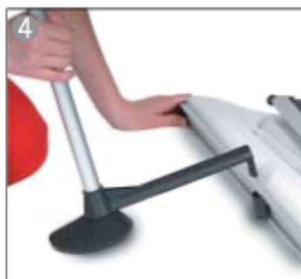
4 Attach bottom rail